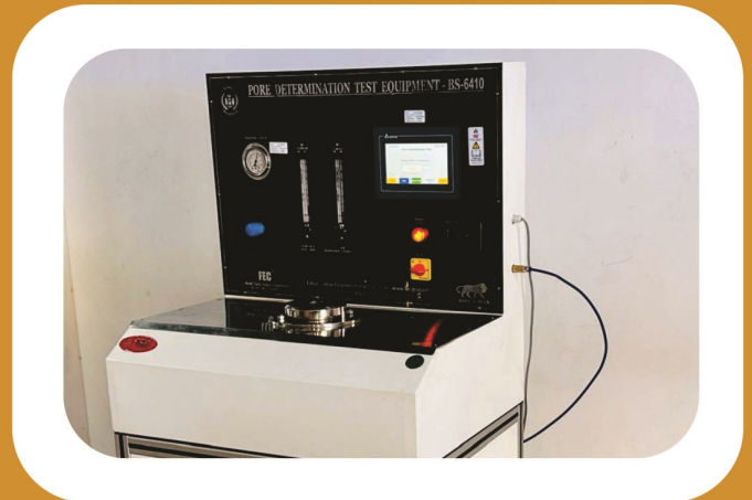
BS - 6410