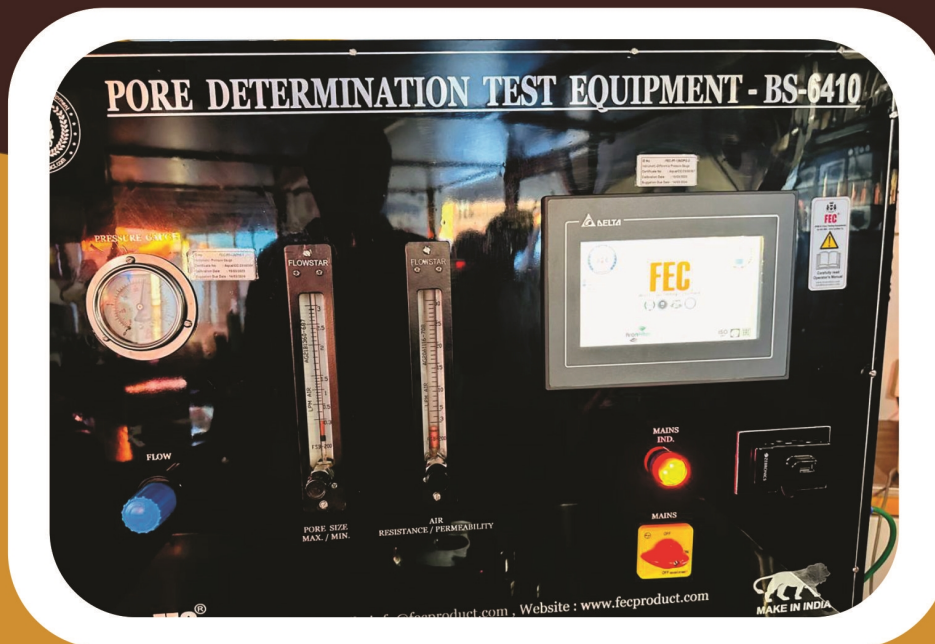
Touch Screen Operating Panel

If would be appreciated that pore size and air permeability are very important characteristics for filtration media. This Test rig made from BS : 6410 -1991.