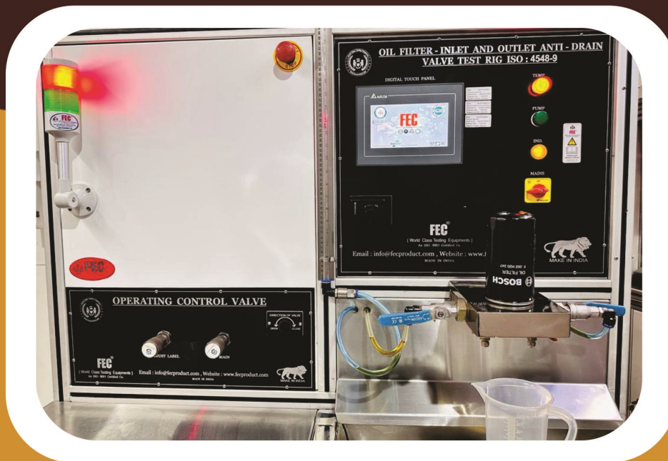
Touch Screen Operating Panel

Methods of test for full-flow lubricating oil filters for internal combustion engines — Part 9: Inlet and outlet anti-drain valve test